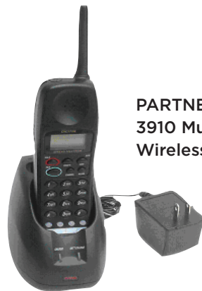
PARTNER 3910 MultiLine Wireless Phone

Down the hall or out in the warehouse? Grab a PARTNER wireless phone and roam far and wide with the confidence you'll be there for customers and colleagues alike. Make faster decisions. Delight your customers. Build your business.